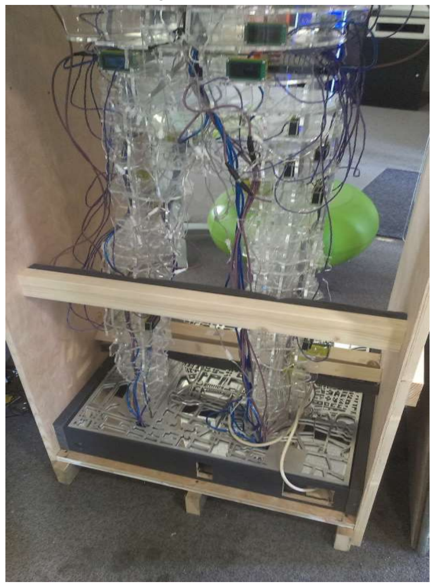
Remove all of the wood across beams...

4. Slide the sculpture out from the bottom with one person at the back of the crate and one person at the front. Its advisable to have a third person and fourth person the steady the sculpture from the base as you remove it from the crate. Do not let it fall over. You should push on the edges not in the middle of the box. See 2 no 5.