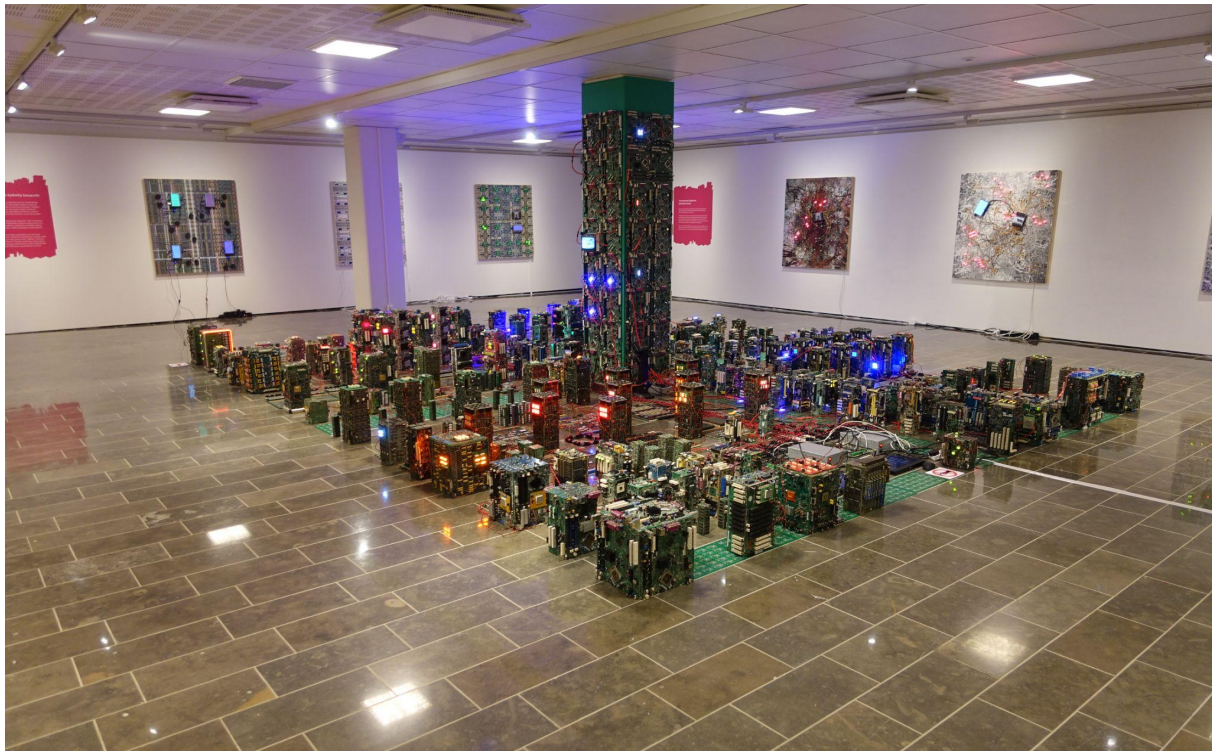
Size approx 24 metre square. ( 4m by 6m)

The artwork represents the complexities of the real time city as a shifting, morphing and complex system. It visualises life in the metropolis on the basis of real time data transmitted from a network of wireless sensors. In essence the artwork is a digital emergent city, a hybrid internet of things (IoT) installation. The artwork you see is a city of electronic components that reflect in real time what is happening elsewhere. Small screens show pictures of the visitors so that they become part of the city. In this sense the city and the artwork are one and the whole artwork functions as an algorithmically coded city observing its real world double.